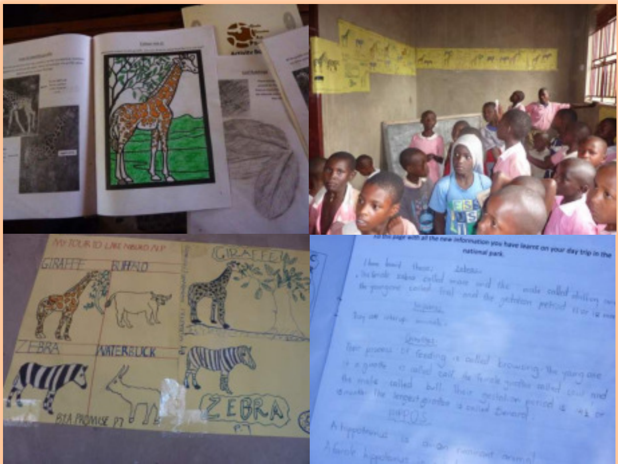
Completed pages in the GEAR activity books and posters made by students and displayed in school.

All trips were a success and we managed to find the giraffe. Follow-up visits were conducted to check activity books and gauge students' understanding of giraffe. Students had shared information they learnt on their trip with their peers, family and friends, widening the circle of giraffe education.