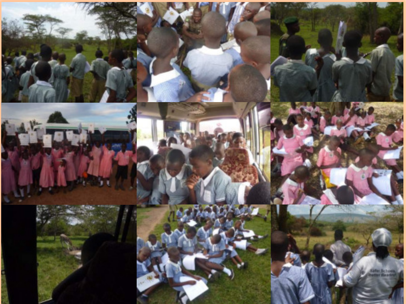
Students on their trips into the park, accompanied by UWA personnel and GEAR local researcher

Numerous schools have contacted the GEAR project hoping to be selected as a beneficiary of the school trips. GEAR has noted that it is the transport which is the largest obstacle for schools when it comes to arranging a field trip. GEAR is exploring options of how to improve and extend its community education project.