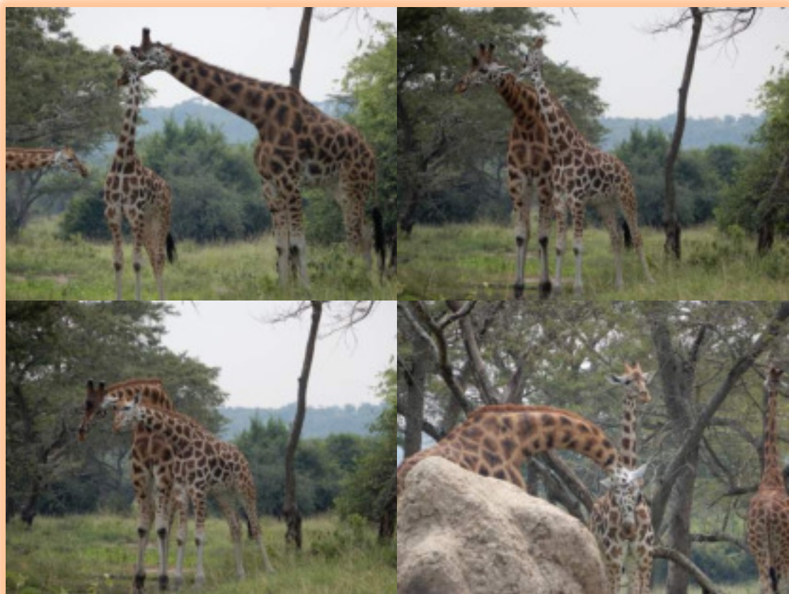
Above: Rocket and Batgirl's calf partake in a little light necking.

The calves are growing quickly and the oldest is already 1.5 years old while the youngest was born four months ago. The two male calves, Nicky and Batgirl's calves, are spending time with the adult males and have started testing their strengths.