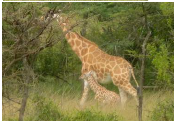
Below: Irish and calf