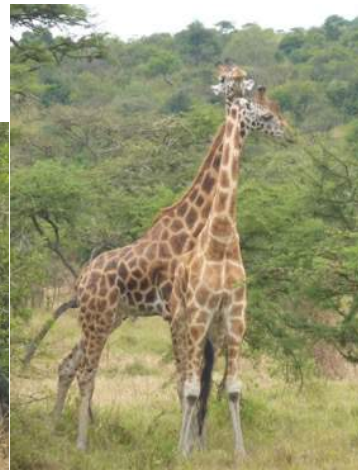
Leiden and Bernard necking

The monitoring team is still struggling to gather early and late activity budget observations but we are working on a new action plan which should help tackle this issue.