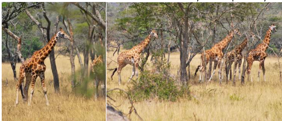
Far left: Leiden limping on his front left. Left: The other three males, Bernard, Kule & Rocket stay close to Leiden.

In March one of the male giraffe, Leiden, was seen limping badly on his front leg. With no apparent wounds but a slightly swollen joint it was assumed he had some muscle or ligament damage. By April he had fully recovered and resumed his sparring with the other males. During the time he was injured he was often spotted alone. Interestingly, when he was with the herd the other three males were usually in close proximity to him.